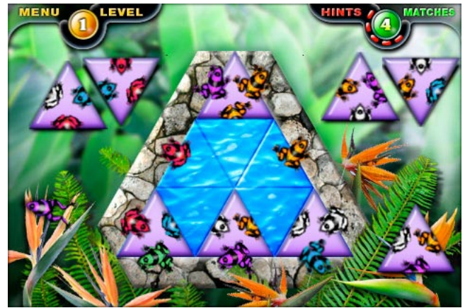
From Triazzle Lite