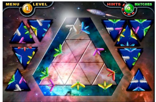
From Triazzle Lite

Updates to Triazzle will include: new puzzle formats and levels; additional characters and backgrounds; progressive play; a scored competitive game mode; pinch and zoom; play your own music; and more!