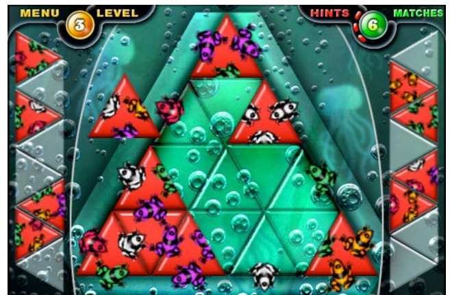
From Full Triazzle

Triazzle is a registered trademark of Dreamship Inc. All rights reserved. © 2009 Dreamship, Inc.