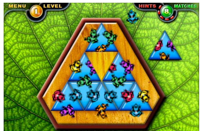
From Triazzle Lite