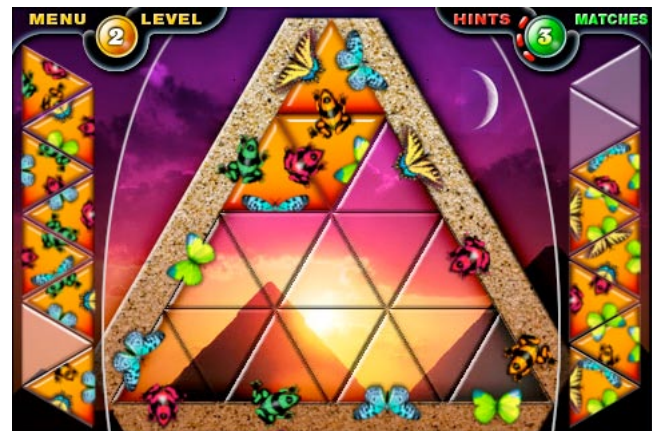
From Full Triazzle