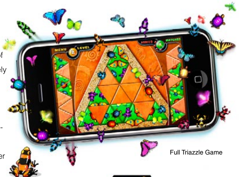
Full Triazzle Game