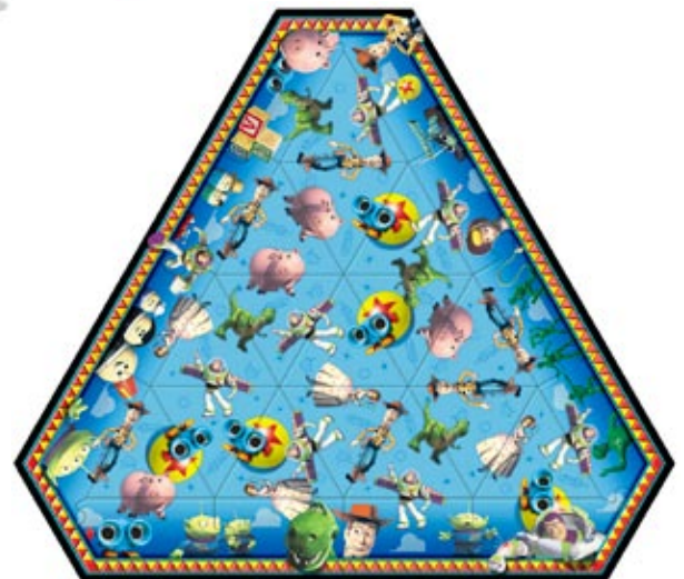
Toy Story® Cardboard Triazzle Puzzle